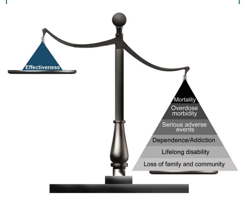
Figure 2 Risk/benefit of opioids for chronic noncancer pain

PDMP. However, in many states, PDMP programs are underutilized, perhaps due to inadequate guidance as to the most effective/efficient use of these programs, and a perception that accessing the program is burdensome to the physician.